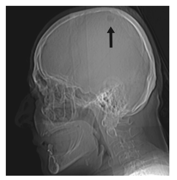
Fig. 4 – Cranial roentgenogram after craniostomy in the sitting position (the arrow points at the burr hole).

Our study is the first to assess the sitting position when craniostomy for CSDH is performed. No particular